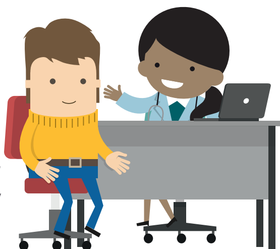
It was here a moment ago Doctor!!

Over the years there have been many developments in diagnosing RA and the future looks brighter still. We are seeing improvements in diagnostic testing that will have far reaching implications including the ability to predict the course of the disease (prognosis) and the identification of which treatment will have the best result early on in the disease, removing the unacceptable trial and error endured currently by most patients as they 'hope' a particular drug works for them.